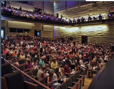
Dallas City Performance Hall

Fine Arts Chamber Players' mission is to enrich and enhance the quality of life for North Texas residents, especially families and children, through FREE concerts of classical music and educational activities.